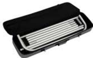
Shown with optional Silver Bag