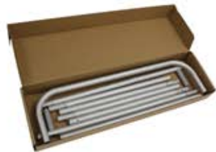
Shown with standard packaging